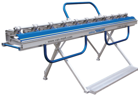
Mark IV Industrial Trimmaster®