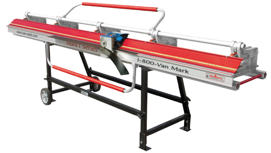
Mark I Series™