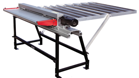
Industrial Slitter Combo