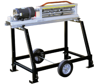
Trim-A-Slitter™ Perf Combo