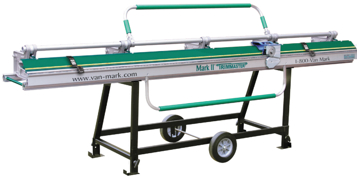
Mark II TrimMaster®