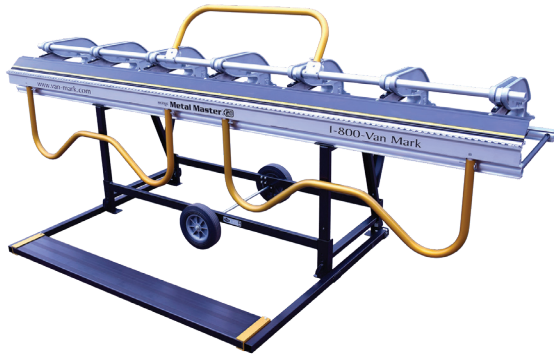
Industrial Metal Master® 20 EZ-Go